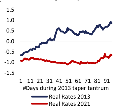
Chart 2: Real rates haven't moved nearly as much as during the taper tantrum

Source: Richard Bernstein Advisors LLC, Bloomberg